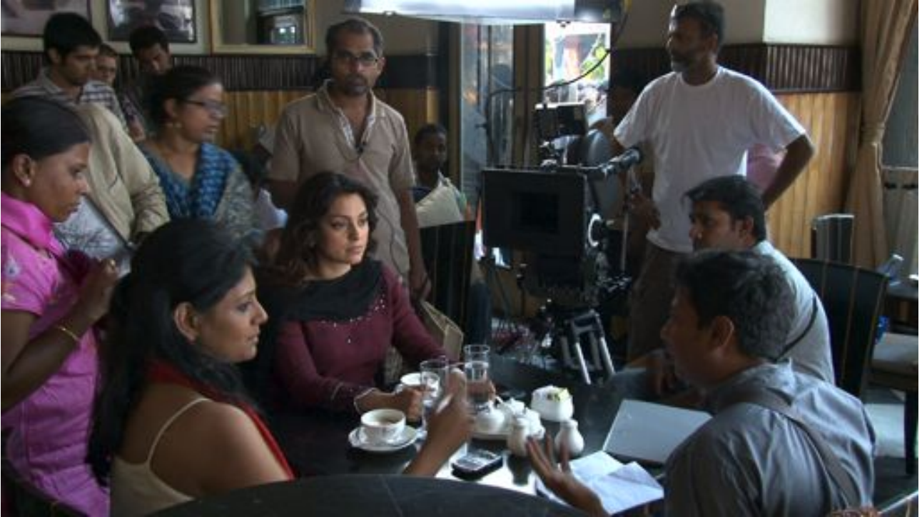
On the set with Nandita Das, Juhi Chawla