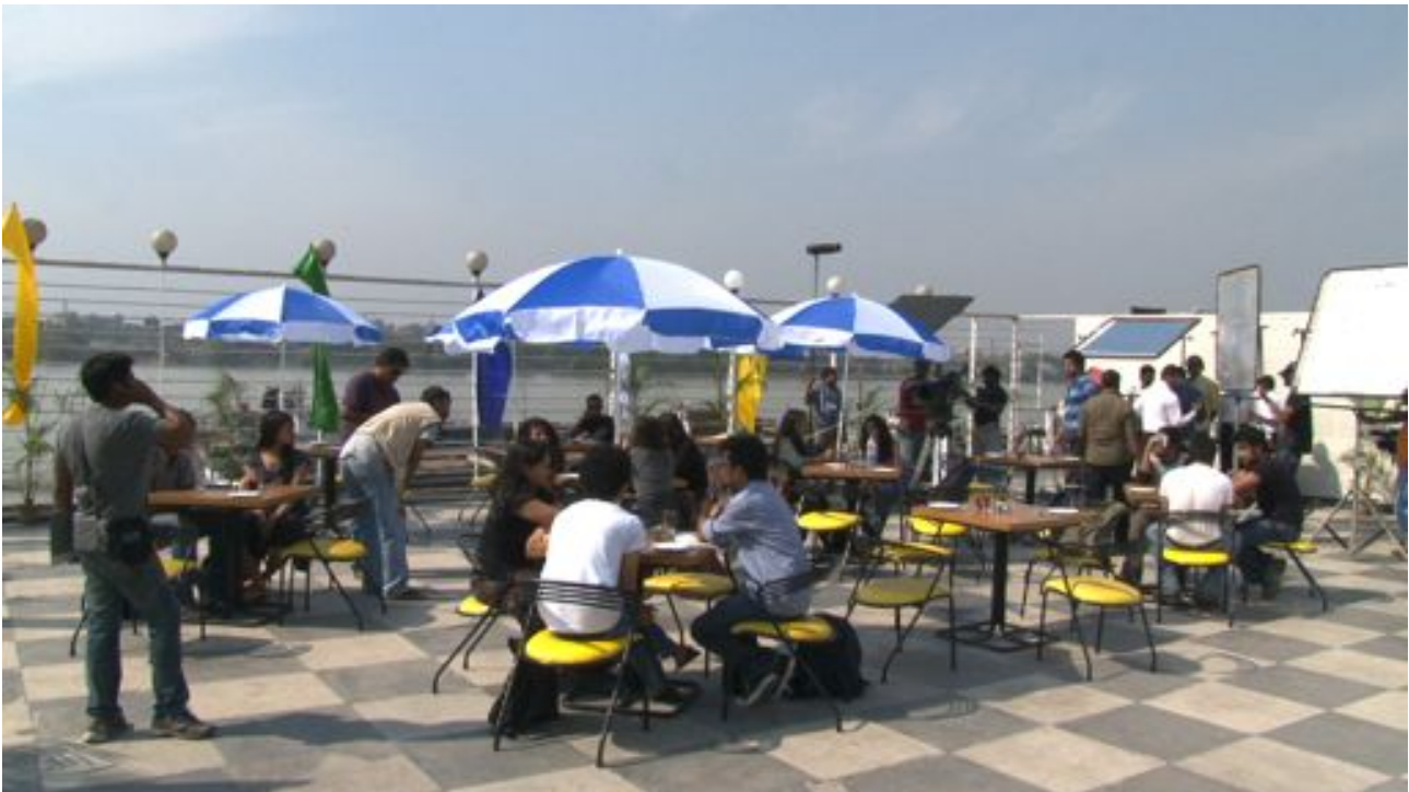
On the set

„Abhimanyu“ is about child abuse, starring Sanjay Suri and Anurag Kashyap; „Omar“ about discrimination, starring Rahul Bose and Abhimanyu Singh; „Megha“ about loss of home and identity, starring Juhi Chawla; and „Afia“ about fear of age and fertility, starring Nandita Das.