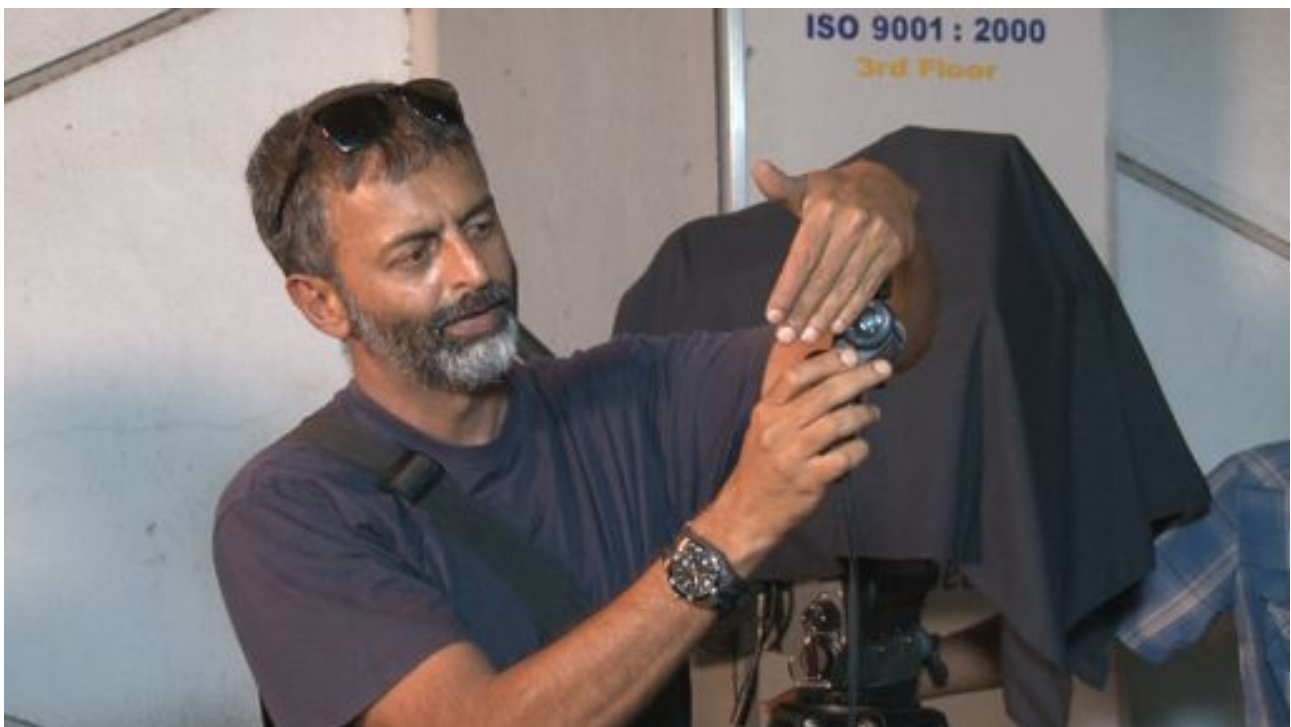
Director of Photography Arvind Kannabiran